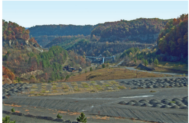
Figure 6. The refuse revegetation guidelines in this publication were developed through methods that included plot-scale field trials, such as those shown in the mid-to-lower left of this photograph, and operational-scale trials conducted by mining firms.

heavy phosphorus, and biosolids treatments maintained vigorous vegetation for five full seasons in Southwest Virginia in Powell River Project trials on slightly acidic refuse materials (figure 6). Subsequent applications of these guidelines, conducted by mining firms working in cooperation with the authors, have demonstrated that these recommendations can be applied successfully at an operational scale.