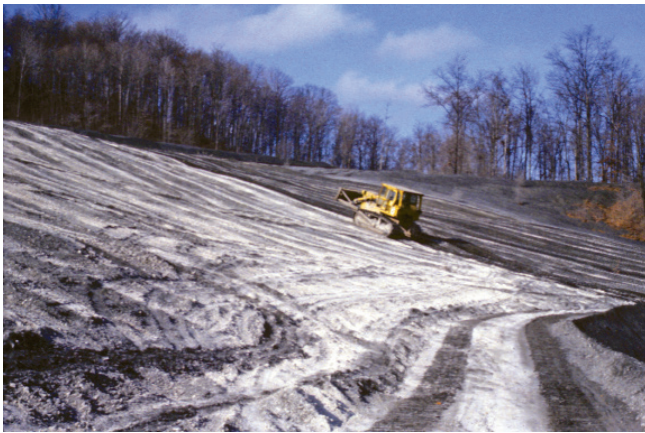
Figure 7. Agricultural limestone being applied and tracked into a coal refuse fill face. Working lime and other amendments on the steeper slopes that dominate most refuse piles can be challenging. For extremely acidic refuse materials, several applications of lime split several months apart may be necessary. It is difficult to spread and incorporate more than 25 tons of lime per acre in one application, even on flat sites.

weathers and leaches for several years and its physical and chemical properties stabilize, it becomes easier to utilize as a plant-growth medium. Many of the older abandoned piles in the Appalachians are invaded by native pioneer vegetation after this stabilization occurs. Care should be taken not to disturb this fragile surface zone on older piles during reclamation, if possible.