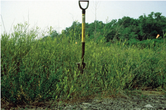
Figure 4. A vigorous and diverse stand of herbaceous perennial vegetation established on moderately acidic refuse in Southwest Virginia by direct-seeding. The refuse was limed, treated with biosolids, and mulched heavily with fiber mulch and straw. The seeding mix shown in table 3 was used on this site. This picture was taken four full growing seasons after seeding.

as biosolids (sewage sludge) or composts supply large amounts of nitrogen and phosphorus in addition to their beneficial effects on the soil physical environment and should be considered for use on refuse piles when available (figure 4). For additional discussion of nitrogen and phosphorus behavior in mine soils, see Virginia Cooperative Extension (VCE) publication 460-121.