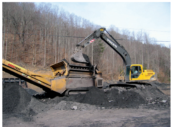
Figure 9. Reprocessing and removing older refuse materials, including pre-SMCRA abandoned mine land piles, is becoming increasingly common in southwestern Virginia, both for the purpose of salvaging marketable coals and for environmental remediation. When the surface materials of these older piles are sufficiently weathered to enable them to support vegetation, separating and retaining these materials for use in reclamation can save money and it can reduce or eliminate the environmental disturbance required to obtain soil cover that otherwise would be needed to restore the area.

When checking refuse properties, be aware of the potential for elevated temperatures inside the pile. If high temperatures are observed, notify the Virginia Division of Mined Land Reclamation immediately. Although spontaneous combustion of coal refuse rarely occurs, it sometimes happens. At least one fire in a Virginia abandoned mine land (AML) refuse pile occurred when the surface material was disturbed in advance of potential reprocessing, allowing atmospheric oxygen to access the pile interior where elevated temperatures had built up due to precombustion oxidation processes. The vast majority of Virginia coal refuse piles do not suffer from this condition but caution is warranted because of the few that do. Coal refuse materials containing significant quantities of combustible carbon should not be used for direct-seeding due to the potential for accidental combustion that may be caused by lightning, vandalism, or other means.