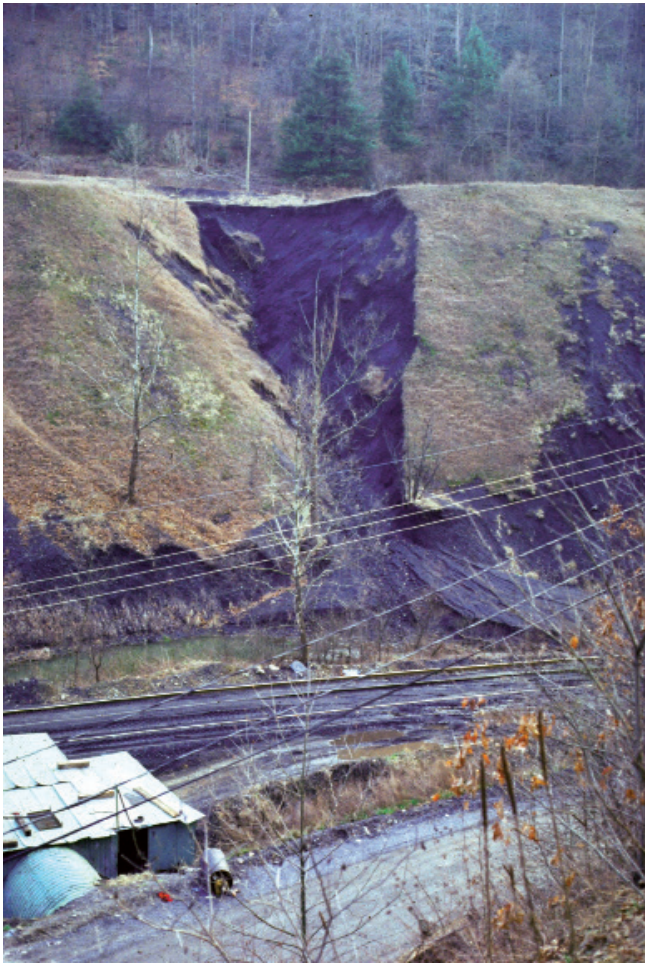
Figure 2. A coal refuse pile located on the banks of Hurricane Creek in Russell County, Va., in a photograph from the early 1980s. The refuse pile, which extends well beyond the photographed area, was produced in the 1950s prior to SMCRA. Although the building in the foreground has been removed, the pile itself remains in place and retains a similar appearance today. This refuse pile has contributed literally hundreds of tons of sediments to Hurricane Creek, which drains into Dumps Creek and eventually into the Clinch River.

pH 3.0 and dissolves the mineral matrix around it as it leaches downward, becoming charged with aluminum, manganese, and other metals, cations, and salts.