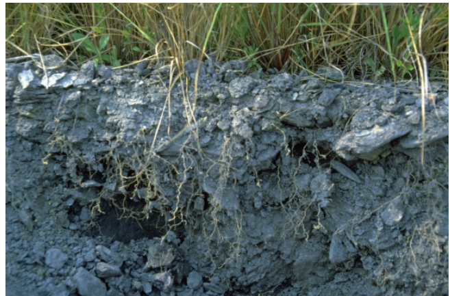
Figure 8. A well-developed grass-rooting system that grew in limed and fertilized coal refuse. Research and experience have demonstrated that many coal refuse materials will respond to lime, fertilizer, and organic amendments and can support vigorous plant growth with little or no soil cover.

Revegetation strategies should establish a quick annual cover to rapidly provide shade and natural mulch for perennials. Any plant materials used on coal refuse must