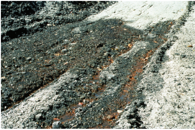
Figure 3. Sulfate salts weeping from an active coal refuse pile. These salts are the product of the acid sulfate weathering process within the fill and are transported to the fill surface by acidified seepage. When the seepage dries at the pile surface, the salts precipitate as seen here. The red colors are evidence of iron that is being released by pyrite oxidation and brought to the surface along with acidic seepage waters.