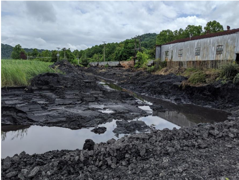
Ditch construction from Zone 1 to Zone 3